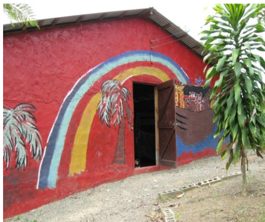
THIS IS ONE OF THE DORMITORIES. WE HAVE TWO DORMITORIES LIKE THIS FOR LIVING ON THE MISSION FIELD